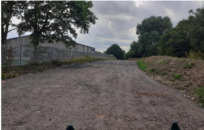
Figure 2: April 2021